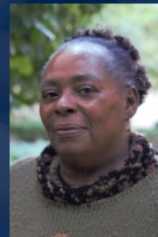
Tambra Hills 1.5 years

While most UDS employees work at our Akron facility, others work in the community helping individuals live independently by assisting them with activities of daily living. Our consumer outreach specialists help with everything from laundry and cooking, grocery shopping, medical appointments and even fun community trips.